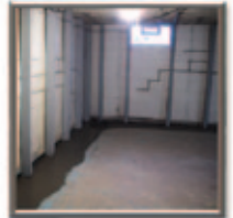
Drain Tile & Reinforcements