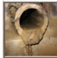
Muddy Drain Tile