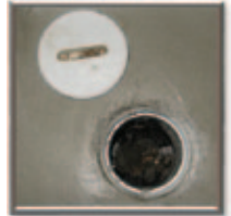
Drain Tile Clean Out