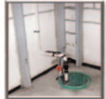
Sump Crotch & Wall Reinforcement