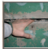
Major Wall Crack